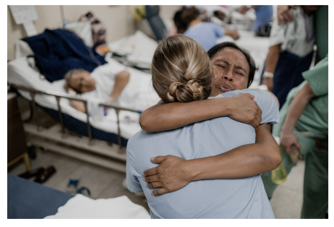
So, as a busy week came to a close, it was time to travel to Antigua and enjoy our last day together.

We are thankful that many lives were touched, and many hugs were shared before patients went home.