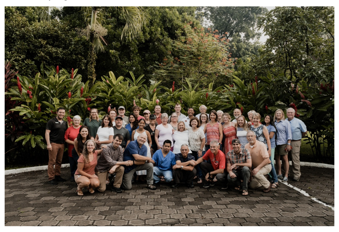
Many thanks to each person that served this week. May God bless each of you and your families as you took time to serve at Clinic Ezell. May God also bless each patient that was touched, as they continue to heal.